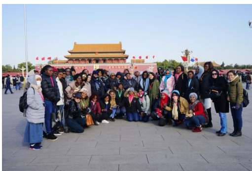
Tian An Men Square - The Heart of China

An International Master degree of Social Work (IMSW) will be conferred upon a candidate after her successful completion of required credits and her thesis approved by the University Academic Committee.