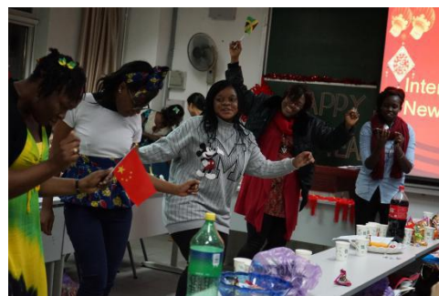
Showtime in Student's New Year Gathering