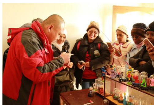
Experiencing Chinese traditional culture