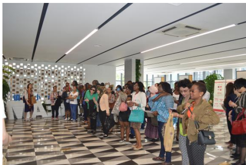
Fieldwork in Hangzhou Future Technical City