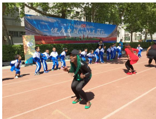
Dancing with Primary School Students

Each student is provided a free single room in the international students' dormitory on campus, with a private bathroom of 24 hour hot shower-water, and air conditioner. Other facilities include public laundry, public kitchen and free Wi-Fi. Dormitory is accessible to students only.