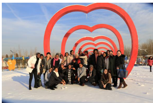
Enjoying the snow in Beijing