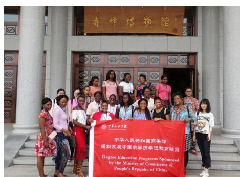
Visiting Chifeng Museum