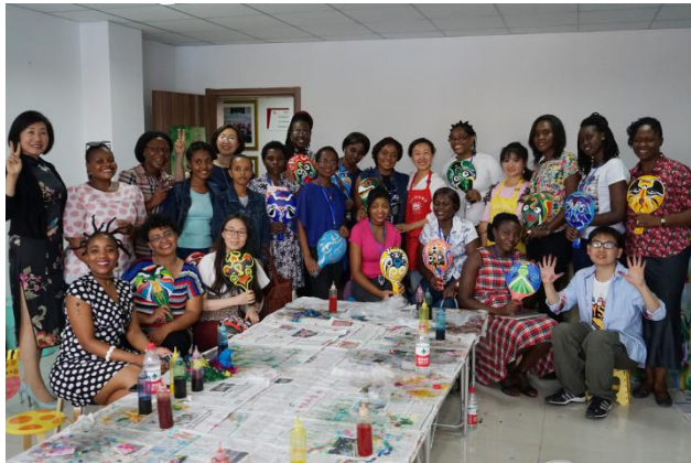
Community Fieldwork in Inner Mongolia

It has the goal of enhancing the students' capacity of applying social work theories and methods into practices, and improving their leadership skills to advocate, organize and