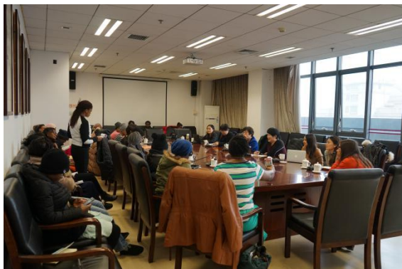
Meeting face to face with the professionals

(3) For the master program “Discipline” is “Law”, “Major” is “Social Work”.