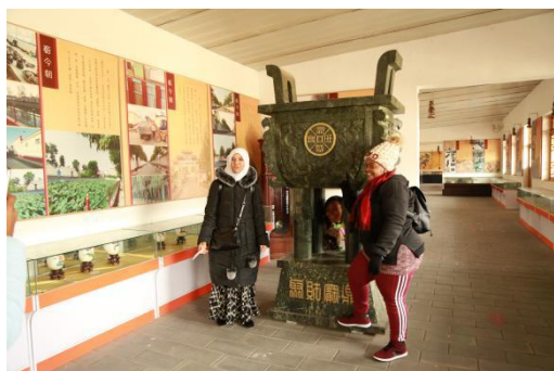
Touching Chinese history

Ph.D., visiting Professor of CWU, specialized in theory and practice of Chinese social policy, and anti-poverty policies in Chinese urban and rural areas.