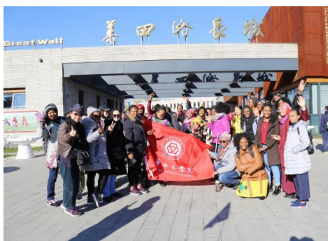
Visiting the Great Wall