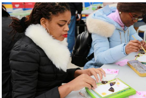
Doing your masterpiece

Field work will be arranged in China and/or in their home countries if needed. Students are required to follow their instructions of handbook of field work to finish it.