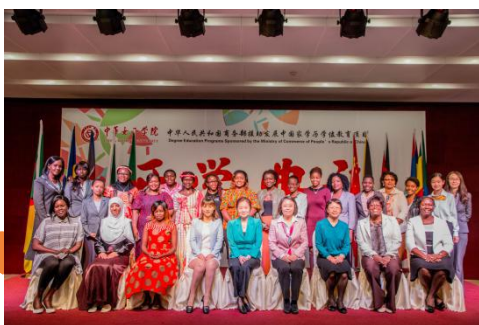
the Program Opening Ceremony 2016

Students graduated from this program will possess both broad academic vision and solid professional basis to enhance their leadership capability, their ability to participate in government decision-making, as well as to advocate and encourage women's participation in social development in their home countries.