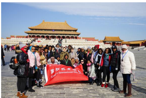
Visiting the Forbidden City